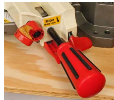
All of the critical controls are on the front where they are easy to access and simple to use.

The operating arm features a comfortable grip with an embedded On/Off trigger switch that reduces the chance of accidental startups. Also atop the operating arm is a comfortable handle for carrying the JET 10" Compound Miter Saw to the job. This handle is properly located so the saw is balanced to make carrying it less tiring. A full