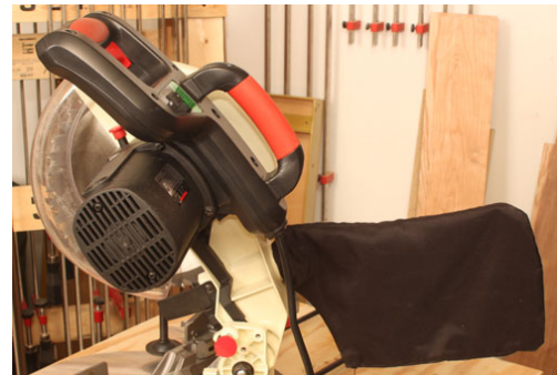
The motor is mounted high to increase capacity. The dust bag and the scoop-shaped chute help keep the work area clean.

Whether you are working in the shop or on the jobsite, the JET 10" Compound Miter Saw will make your square, bevel, miter and compound cuts more accurate. The large capacity, rugged construction and our 3-year warranty mean you can focus on the job at hand!