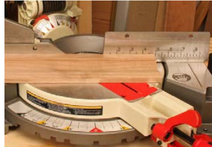
The spacious table (left) helps keep the wood stable during the cut. The handy scales (right) around the moveable miter table, at the bevel pivot and on the fence to make working faster and more accurate.

The table portion also has holes for securing the JET 10" Compound Miter Saw to the work surface for maximum safety and accuracy. We also include a tool-free work hold-down clamp that can be positioned to either side of the blade.