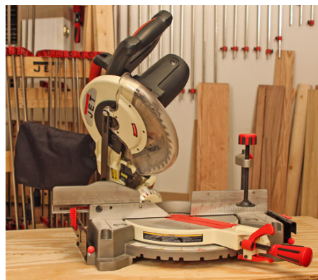
The JET 10" Compound Miter Saw has the capacity, accuracy and durability you expect from JET.