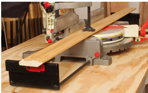
The pull-out work supports at each end of the table expand the overall supported work space to 42-3/4"!

The table portion also has holes for securing the JET 10" Compound Miter Saw to the work surface for maximum safety and accuracy. We also include a tool-free work hold-down clamp that can be positioned to either side of the blade.